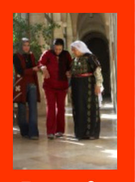
Pray for Peace and Justice