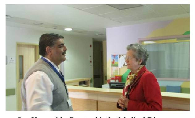
Our Honorable Guest with the Medical Director