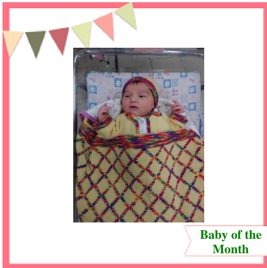
Baby of the Month