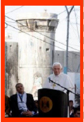
"Be a Bridge of dialoge and constructive cooperation"

Thank you Holy Father for your support to the Christians and Christian institutions in the Holy Land, for having once more demonstrated the importance of inter-religious dialogue and for having reminded everybody that the history of our salvation began here in Bethlehem on this land which epitomizes the difficult way of God with humanity, the salvation of all people on earth.