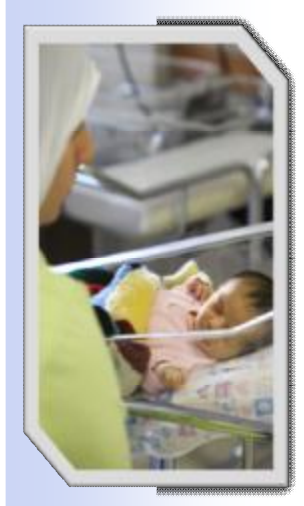
"Because the poorest deserve the best"