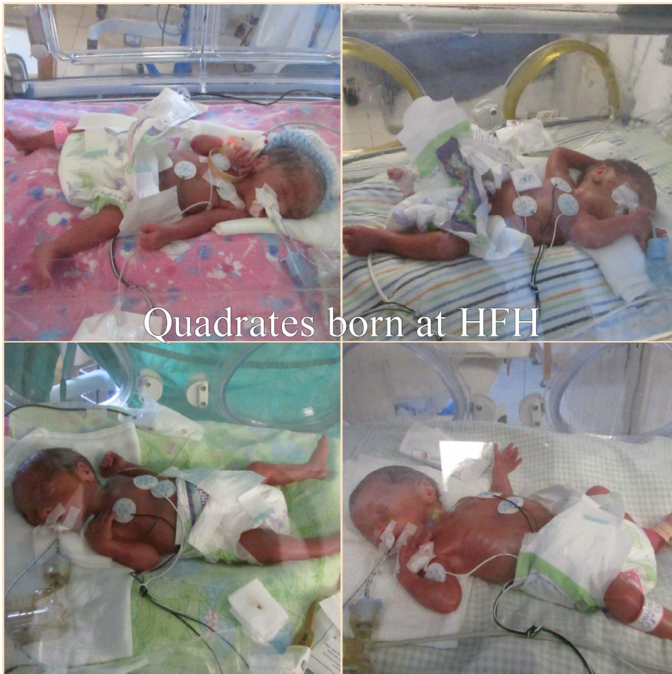
Quadrates born at HFH

We love you , We care for you , that is why we are called Holy Family Hospital